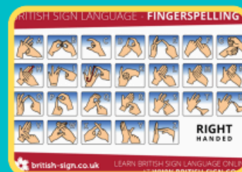
British Sign Language (BSL)