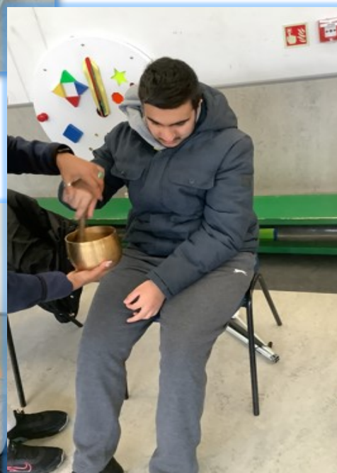
Celebrating World Book Day in Sixth Form

We've had a fantastic Book Week with lots of activities across the school. Next week we will share all of our news and photos from the week.