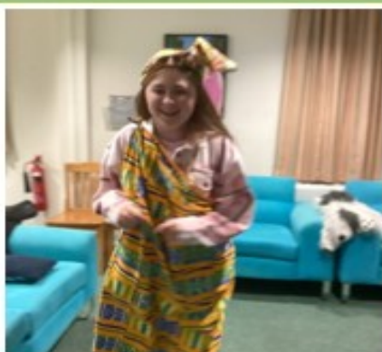
Black History Month 2023