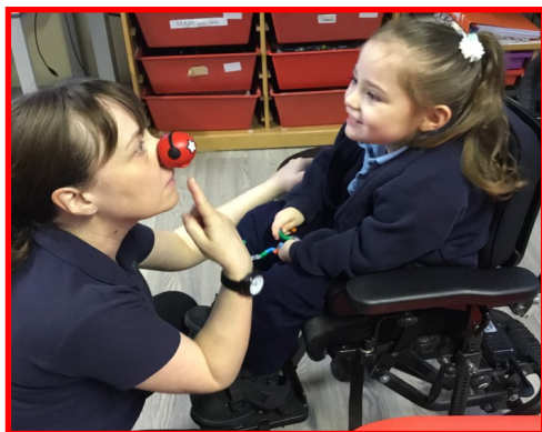
Tabla class Red Nose Day celebration

We had lots of fun dressing up and enjoyed the sensory story: "Looking for laughter with Tamir".